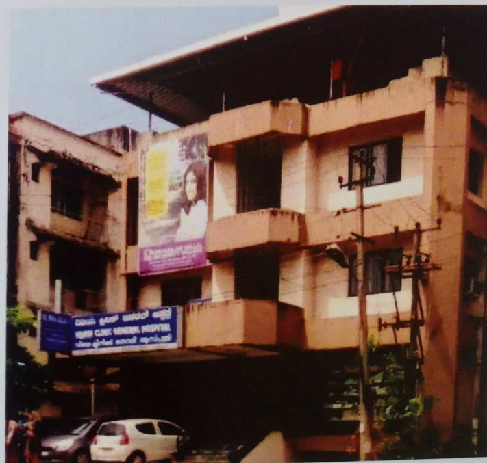
Vijaya Clinic General Hospital Bunts Hostel Road, Mangaluru