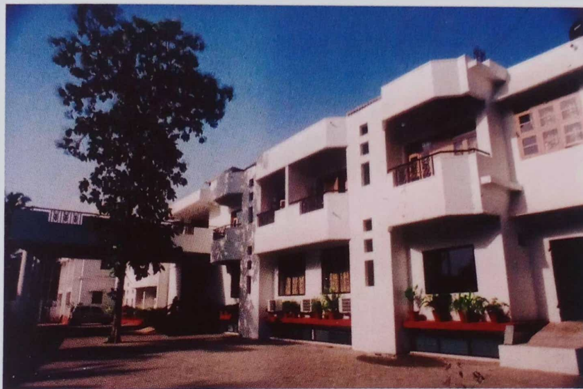
Vijaya Clinic, Maternity & Surgical Nursing Home, Kadri Kambla Road, Mangaluru